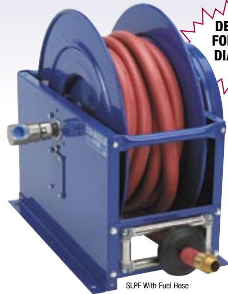
SLPF With Fuel Hose

TOP REWIND ASSEMBLY (WALL OR FLOOR MOUNT): #8100 (For 3/8" - 3/4") or #8101 (For 1" - 1 1/2") & 20458 - 4-way enclosed pinch-proof stainless steel rollers are 1" in diameter supported by powder coated steel brackets. Specify wall or floor mount & specify drum width. Weight: 10 lbs.